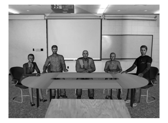
Figure 1B: Virtual public speaking world. Figure 1B should be reproduced at one column width.