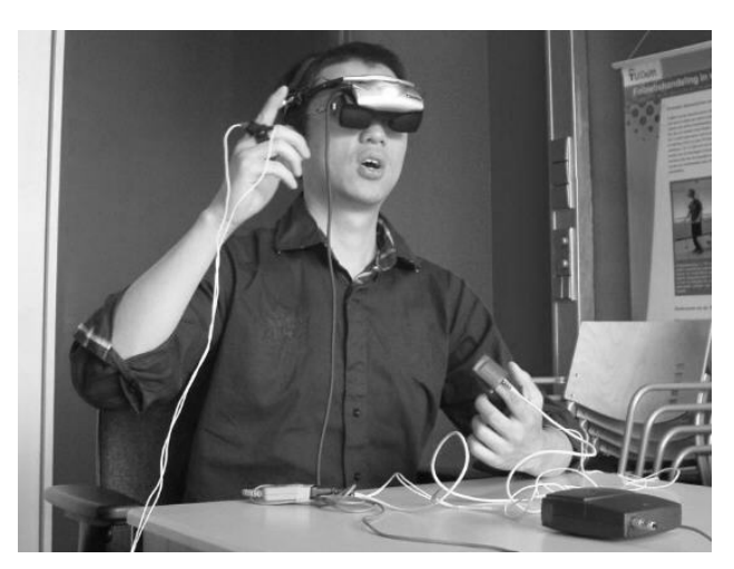
Figure 1A: Individual wearing head mounted display and physiological measurement equipment in the experiment. Figure 1A should be reproduced at one column width.