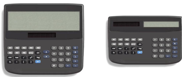
Figure 1: Large (left) and small display (right) calculator.

The experiment involved an application, written in Delphi 5, consisting of two calculators, and a recording mechanism to analyse the message exchange between the components [1]. The two important interaction components [1] identified in the development of the calculators were the so-called editor and processor component. The editor was responsible for forming the equation and passing it on to the processor. Users could enter a complete equation, including special mathematical functions (sine, ln, square root, etc), which would be passed on only after users pressed the '=' button or the 'STO' button followed by a memory button (M1 to M6). The processor processed the equation, placed the result in one of the six memory places if requested, and sent the result back to the editor. Therefore, users could only interact with the processor by mediation of the editor component. Two versions of the editor were designed: one with a large display (Figure 1, left), the other with a small display (Figure 1, right).